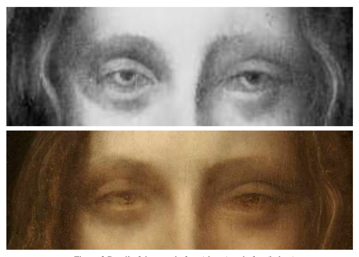
Figure 3 Detail of the eyes before (above) and after (below).

Secondly the eyes of Christ in the first painting of Salvator Mundi are horizontally uneven and are of different sizes. For instance, the lower lid of the left eye is much too low. The restoration version, however, lifted the left eye lower lid while erasing parts of both eyes. This cannot be another Leonardo mistake. The left eye is much smaller than the right eye and is partly abraded while the right eye is partly glazed over. Why all of this deconstructing makeup? It appears that the purpose was an attempt to recreate the " sfumato " shading effect that Leonardo is so famous for, and which was reconstructed to represent his signature. It was from that standpoint that the restoration had been made to convince the buyers, and it did.