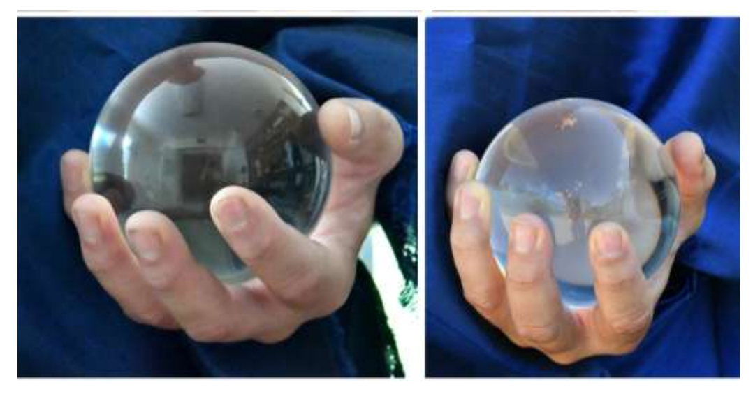
Figure 4 <a href="http://veronicasart.com/the-salvator-mundi-painting-of-leonardo-da-vinci-is-it-real-or-fake-da-vincis-orb-is-not-his/">http://veronicasart.com/the-salvator-mundi-painting-of-leonardo-da-vinci-is-it-real-or-fake-da-vincis-orb-is-not-his/</a>