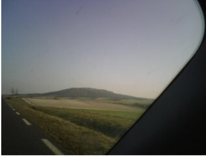
Figure 4. Mont-Aimé, Champagne, France, where 183 so-called « heretics » were burnt alive by the Dominicans.

The executioner of this great inquisition holocaust was an older associate of Thomas Aquinas, the Dominican monk, Robert the Bugger (Robert le Bougre), who was of Bulgarian origins and who had been recruited to the cult of Catharism in Bulgaria where he had been a leading figure as a “Perfect Cathar”, during the first quarter of the 13 th century. He became known as “ the Bugger” because he had been associated with the Manichean Bogomils, which was the pagan cult that had been used to factionalize the Greek Orthodox Church during the early centuries of Christianity. In France, the Dominicans had recruited Robert the Bugger for the purpose of hunting down Cathars and executing them for the sin of heresy.