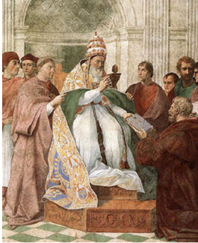
Figure 5. Raphael Sanzio, Pope Gregory IX promulgating the Decretals . (1511)

Ugolino, count of Segni, Pope Gregory IX (1227-1241) was the nephew of Innocent III and a true continuator of his murderous policy. The irony, here, is that Raphael had painted Gregory IX in the features of Julius II and had located him prominently in the section representing Justice in the Room of the Signature. I have no doubt that Julius II must have been very proud of being immortalized as Gregory IX by Raphael. It was Gregory IX who first instituted the Papal Inquisition against heretics, in 1231, and was, historically, the most prominent Vatican prelate to discriminate against the Jews. Such was Gregory and Julius's sense of "Justice."