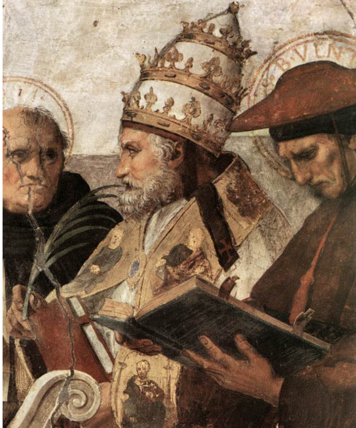
Figure 3. From left to right, Thomas Aquinas, Pope Innocent III, and St. Bonaventure. ( The Dispute , detail)

With this glance that Innocent III gives Thomas Aquinas, and the obedient stare that Aquinas gives back in return, Raphael has captured, in a unique fugitive moment of irony, the cognitive closure of the pure evil of three hundred years of bloody crusades. The nature of the Ultramontane conspiracy between the Dominicans and the Papacy was very simple. What Thomas Aquinas, "the dumb ox," as his fellow students called him, accepted to do was to provide the Popes with the legal justification for committing genocide throughout Europe. Even though Aquinas wrote a few decades after Pope Innocent III had died, Raphael brought their connection to life in order to express the universal role that both the Dominicans and the Ultramontane Pope who created them played together inside of the Catholic Church. The congruence of evil in this glance reflected the highest point of the confluence of political and religious power inside of the Catholic Church since the beginning of Christianity.