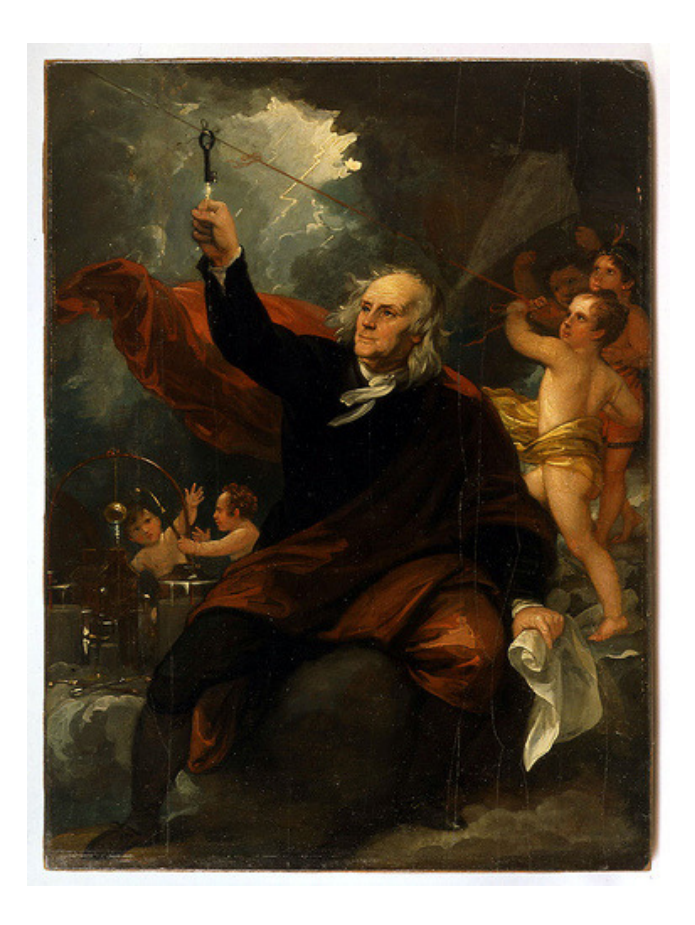
Figure 1. Benjamin West, Benjamin Franklin Drawing Electricity from the Sky , c. 1816. Note the two adult babies conducting a scientific experiment!!

The Hudson River School came out of the founding moment of the National Academy of Design in 1926, and the Academy of Design was, itself was modeled explicitly and by name reference on Benjamin West's creation of the Royal Academy of Arts of 1768, which, itself was founded, as I will show you in a moment, on the same principle of the sublime.