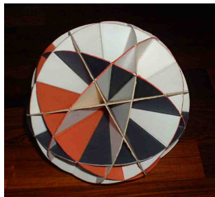
From the desk of Pierre Beaudry