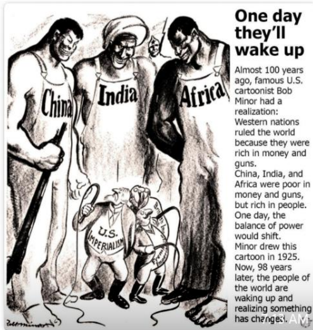
Figure 1. The truth about continued Western World colonialism

Among all of the governments of the world, it is the Chinese Ministry of Foreign Affairs which stated the clearest understanding of this danger with respect to the United States, in a recent report entitled, US Hegemony and Its Perils , which stated unambiguously: "This report, by presenting the relevant facts, seeks to expose the U.S. abuse of hegemony in the political, military, economic, financial, technological and cultural fields, and to draw greater international attention to the perils of the U.S. practices to world peace and stability and the well-being of all peoples." 3