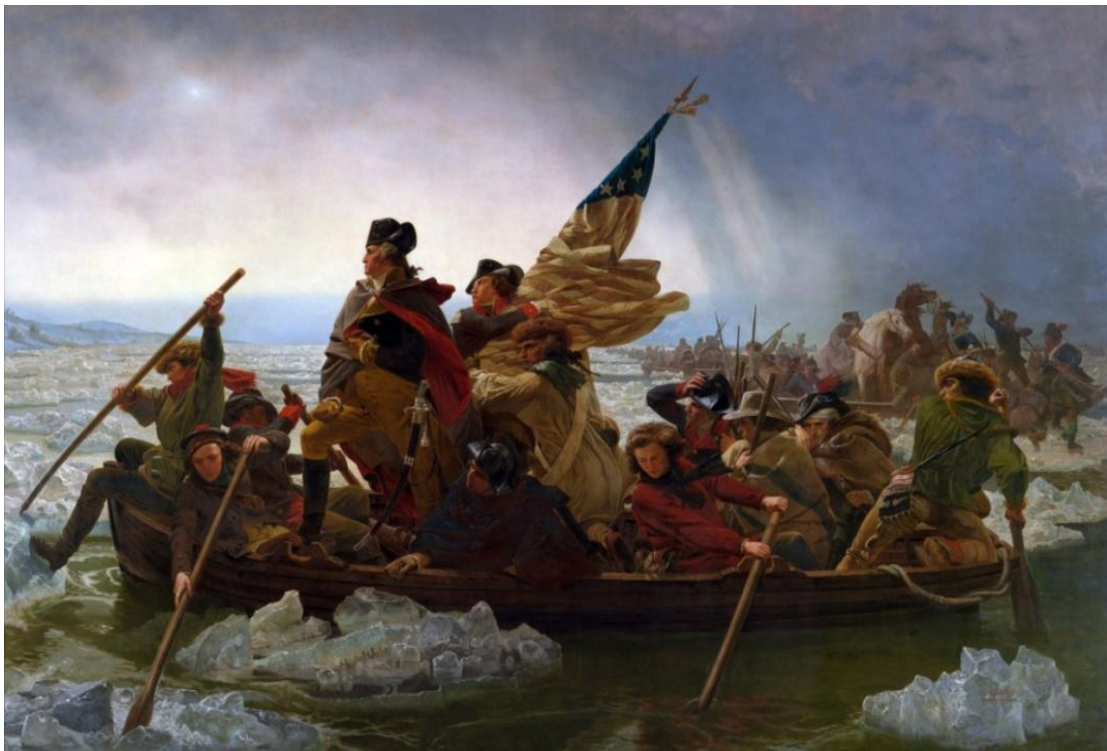
Figure 3. Washington Crossing the Delaware by Emanuel Leutze, 1851

In October of 1793, Carnot found himself in the same situation that Washington had found himself on Christmas Eve 1776. Thus, 17 years later, Carnot relived the same axiomatic historical moment of simultaneity of temporal eternity that Emmanuel Leutze painted in his Washington Crossing the Delaware . Following Washington in his mental footsteps, Carnot won the French War of Independence by changing the rules of the game. In a condition that was very similar to the American Revolution, the French Army had been decimated and the foreign invading armies were everywhere in superior forces. Carnot expressed this fundamental emotion in the poem he entitled ODE TO ENTHUSIASM: