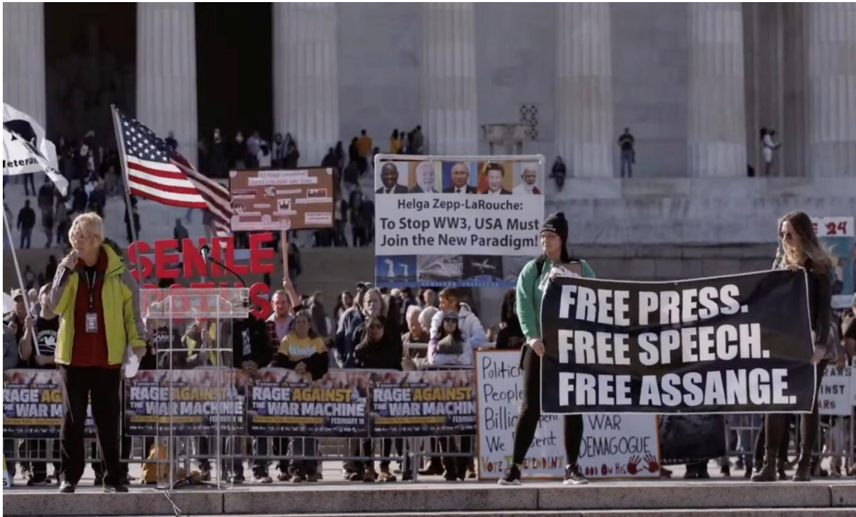
Figure 4. Washington D.C. Peace Rally, 2023-02-19.