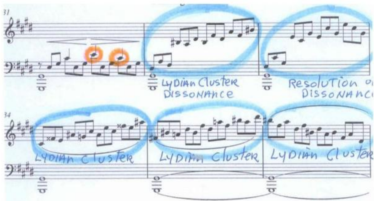
Figure 1. Beethoven's Piano Sonata Opus 27, No. 2, in C Minor, first movement, measures 31-36.

One of the best ways of accessing such a universal truth is by using the Lydian intervals of classical musical composition as Johann Sebastian Bach, Amadeus Mozart, and Ludwig van Beethoven taught us.