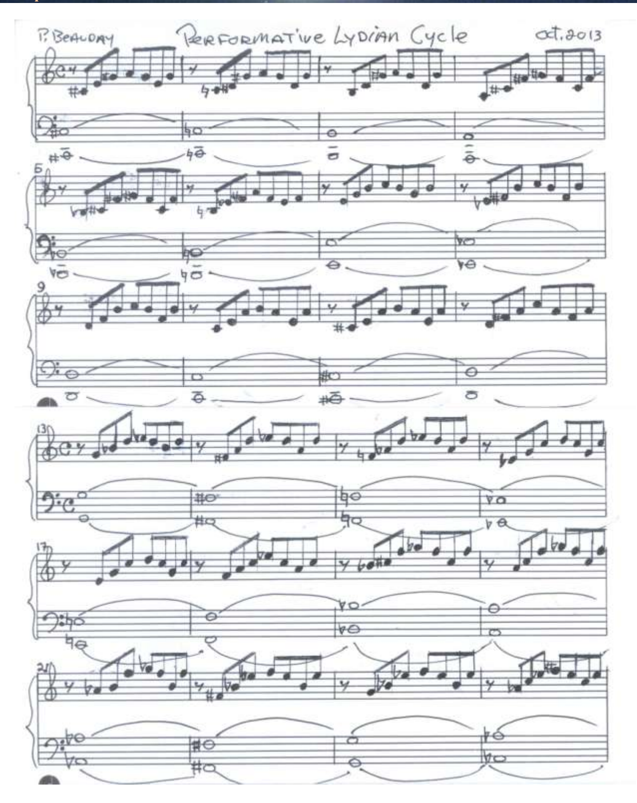
Performative Self-generating Lydian spiral action by Pierre Beaudry