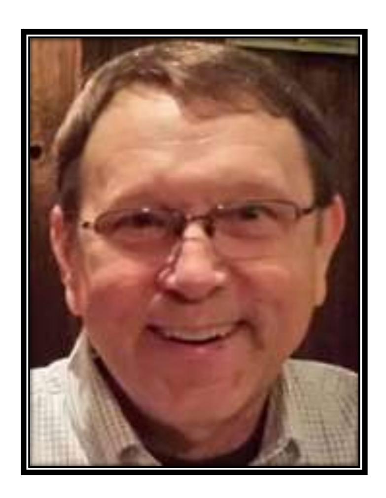
Page 1 of 8