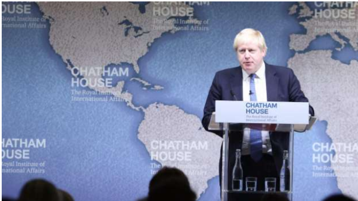
Figure 2 British Foreign Secretary Boris Johnson speaking at Chatham House in London, 2 December 2016.

Why is this British coup against President Trump going to fail? Because it is the Trump administration which has created this very ill-advised Syrian anomaly; and therefore, it is the Trump administration which must be responsible for the outcome. Therefore, think of the following possibility for a moment. What if Trump should go past the 180 degrees mark and turn in his policy against Syria around to go full circle? This could show how British Intelligence was directly involved in running Islamic terrorism world-wide. What if Trump were to simply wait for the second British shoe to drop, for instance, in France? The way to figure out the answer to this “ What if... ” is to ask the following two questions: