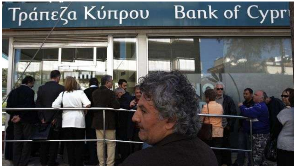
Figure 1 Cypriot citizens to American citizens: “We lied and this is what happened to us. Can you help us have the courage to tell the truth?”

Manuel Alegre, Portuguese Socialist Party