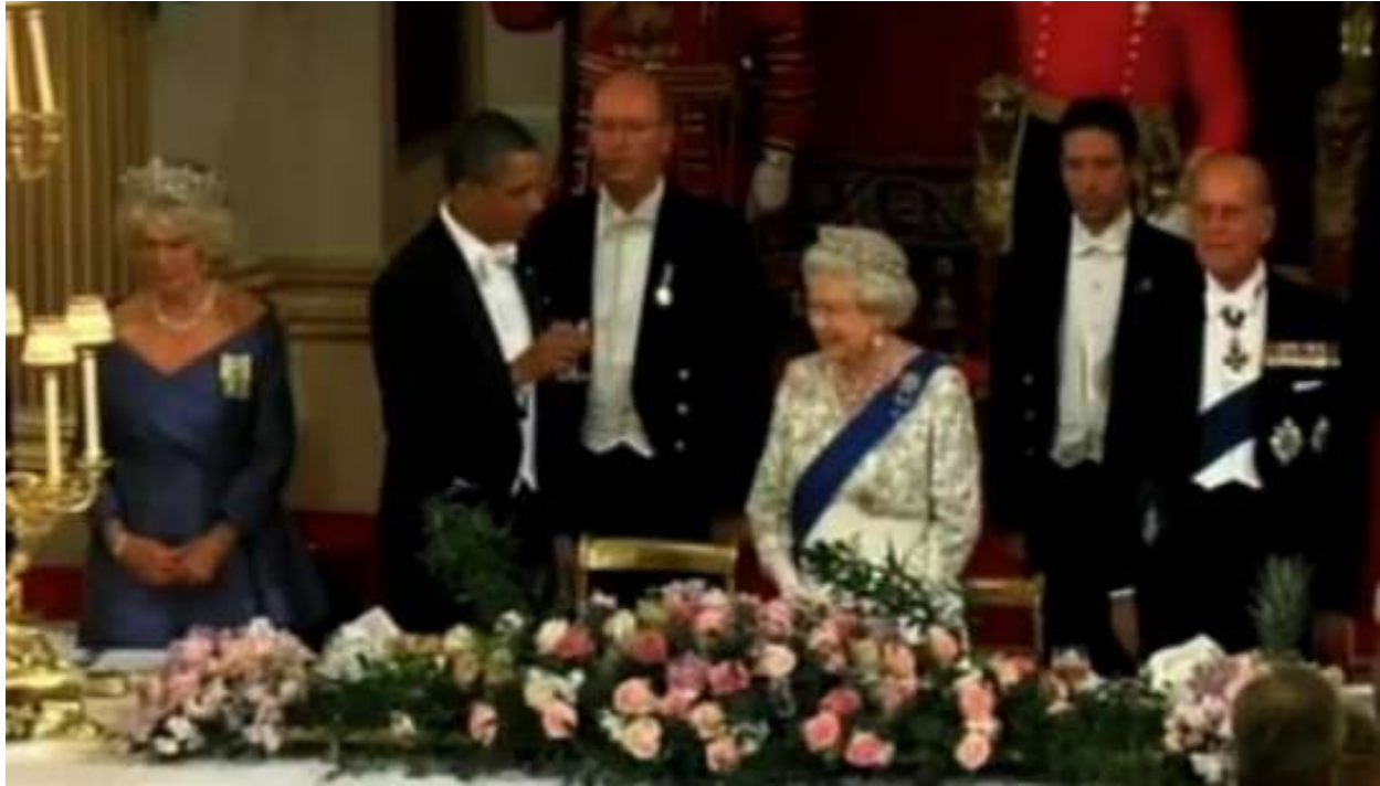
Figure 5 President Barak Obama making a “faux pas” while toasting the Queen. He was politely put in his place with a resounding “God Save the Queen.”

Similarly, the system of derivatives, which has been dominating the world monetary system in the last thirty years, is nothing but the financial arm of this fake British imperial system of lies that has come crashing down on society like a five hundred pound tick on a tired dog. The bad joke is that the derivative system was not built to make money as such, but to get bankers gain ascendancy and power over national governments. The aim is not greed, but blood sucking genocide aimed at reducing the world population from seven to about one billion people and at making believe that virtual reality is better than reality. This is why the biggest fear of the derivative system is transparency and Glass-Steagall . You adopt Glass-Steagall now and you will destroy British Empire once and for all.