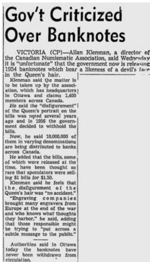
Figure 8: Vancouver Sun, April 30, 1959.

The ambiguous image represents precisely Lyn's idea of metaphor; that is, two contradictory images of sense perception and the imagination that the mind connects to create a third mental image which is an uplifting irony: the first is literal, the second is a higher composite of the literal and the reflected, and the third is the surprising connection of the two as something completely new and shocking to the human mind. Thus, Gilbert shows the true beauty of the mind in contrast with the fake beauty of perception. Plato called such a gestalt the dialectics of the Socratic dialogue, but Hegel made a mess of it and the process has never been understood properly since. This sort of composition goes well with the work that Gilbert had to do during World War I as a camouflage artist for the U.S. Shipping Board (The Emergency Fleet Corporation).