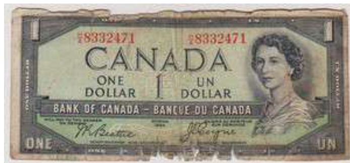
Figure 7. Was the devil's head in Queen Elizabeth II's hair a deliberate engraver's irony? Some Canadian monarchists very seriously think so. (Paper clipping from the Vancouver Sun , April 30, 1959.)