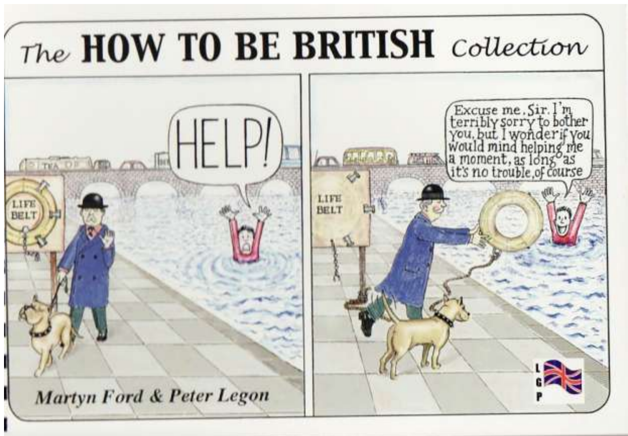
Figure 3 Your Queen wants you to change: “Let the real man in you drown and save the polite fake”

That lie is the same as those disguised under the garb of politeness and of keeping company manners. You tell an obvious lie about Uncle Joe during Sunday dinner, and no one around the table dares to contradict you. As a matter of fact, lying in order to start a war has been the oldest company manners trick in the book, because it is always a test balloon to see if the population has enough courage to contradict it and if it will have the courage to stick with the truth. If you lose your courage in such a Sunday dinner situation, if you don’t stick to the truth, you have begun the countdown toward your eventual menticide and suicide.