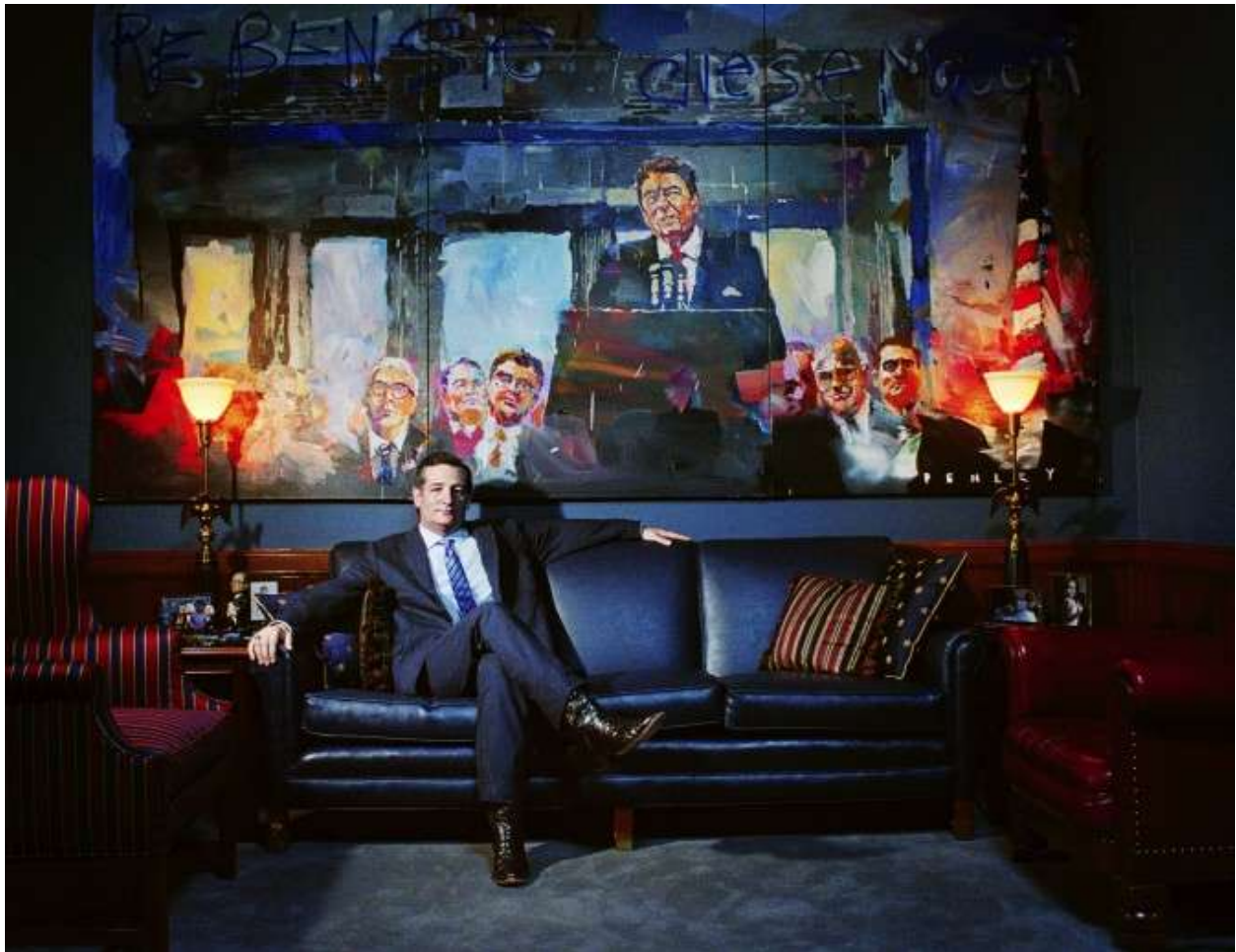
Figure 3 Ted Cruz pompously staring at you from his Washington DC Senate Office.

The Presidential campaign has now reached the turning point. The time has now come to introduce violence into the campaign and build up the support for an apparent alternative to FASCISM with an appeasement campaign under the guise of a CHRISTIAN FUNDAMENTALIST THEOCRACY. Yes, that is how Satan dresses up in Texas. (Figure 3) What are the buttons they are going to push on the American population? There are two satanic buttons: One is a conservative purist, the other a liberal Wall Street populist. So, my question is: “Why have the British chosen Cruz to become President of the United States?”