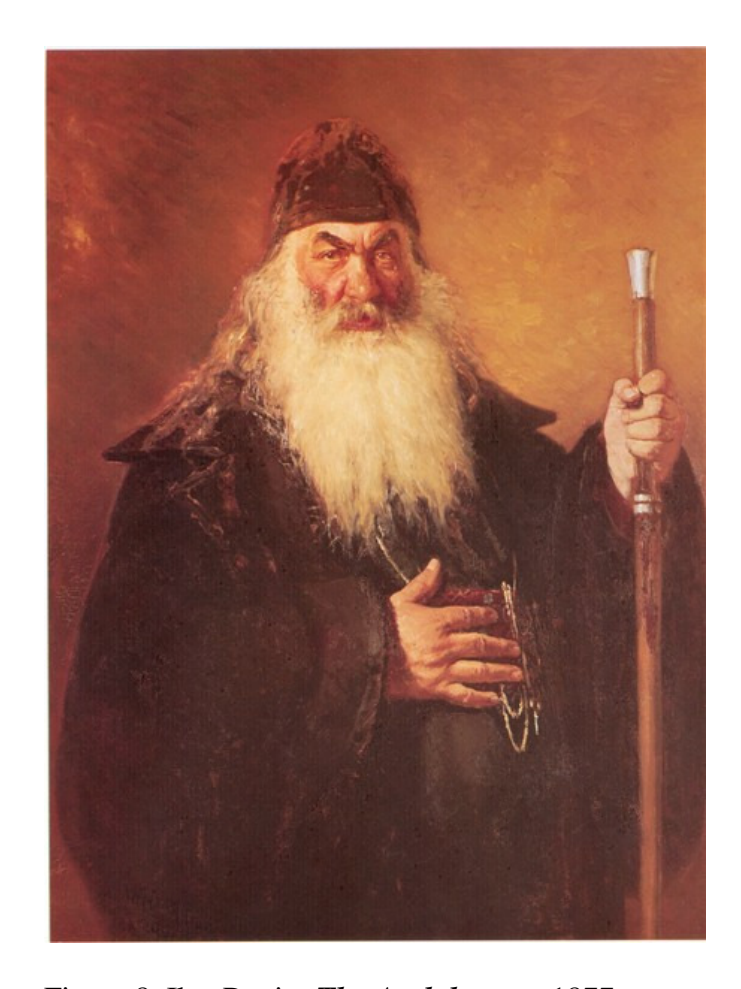
Figure 8. Ilya Repin, The Archdeacon, 1877.

Here, Repin has reached universal truthfulness in the highest form of irony by representing one of the most characteristic caricatures of Russian culture. With The Archdeacon , Repin has reached a higher level of expression of false spirituality in the Russian culture, a superior truth to what could be found in the so-called Western European culture of his time. With The Archdeacon , Repin became the Rabelais of the canvas. Artists are seldom able to characterize their own work properly in words and identify the nature of their purpose in history; however, this was not the case with Repin. In two other letters to friends, Repin identified his creative insight quite beautifully and truthfully: