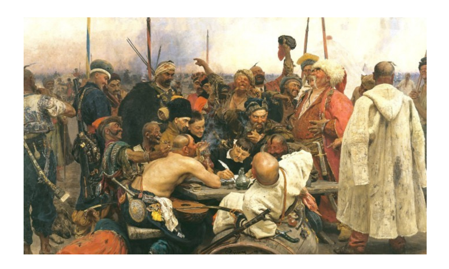
Figure 4. Ilya Repin, The Zaporozhie Cossacks Writing a Mocking letter to the Turkish Sultan . 1880-91 (State Russian Museum).

During the 17<sup>th</sup> century, Ukraine was a constantly disputed borderland region between Catholic Poland and Muslim Turkey. In fact, the very name of Ukraine means, "border." A Cossack settlement known as Zaporozhie Sech was located on an island of the Dnieper River, facing Turkey over the Black Sea. However, in 1675, Poland had signed a treaty that surrendered Zaporozhye to the Turks. The Cossacks were not very happy when, after several years of being harassed by the Turks, the Muslims came as an invading force to grab their land. The Cossacks had no intention of giving up their freedom, so they fought bravely against the invading Turkish army. One day, in 1680, after the Muslims had lost 15,000 of their troops under the walls of the Zaporozhie, the Sultan of the Ottoman Empire sent the Cossacks an ultimatum. The letter of Mahmud IV read as follows: