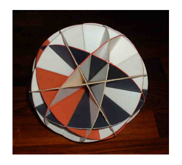
From the desk of Pierre Beaudry