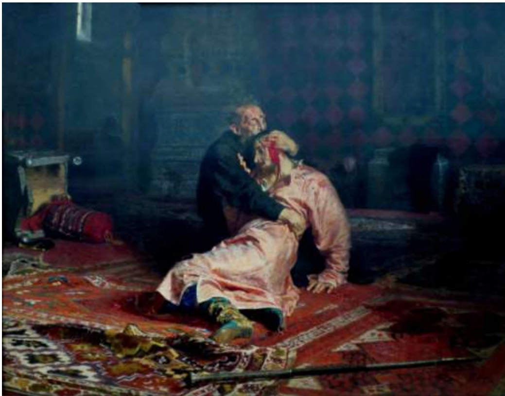
Figure 3 Ilya Repin, Ivan the Terrible and his son Ivan on Friday, November 16, 1581 . 1885 (Tretyakov Gallery, Moscow)

Not only does it reflect a courageous act of true friendship and universal liberty on the part of the Russian President, Vladimir Putin, but the monument is also a reflection of another memorial that was created by the Ukrainian artist, Ilya Repin more than a century ago, with his 1885 painting entitled Ivan the Terrible and His Son on Friday, November 16, 1581 .