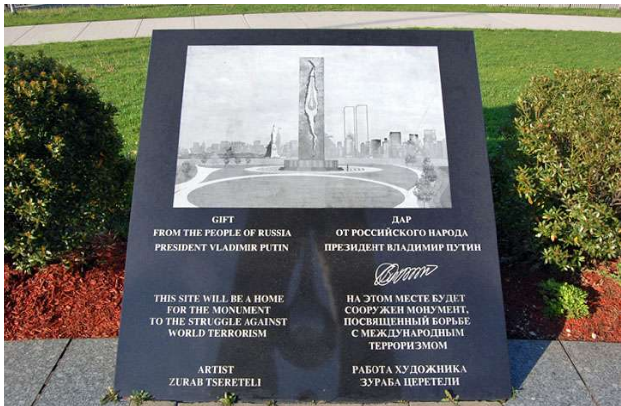
Figure 2 Gift from the people of Russia offered by president Vladimir Putin.

However, the choice of the current place in Bayonne turned out to be much better, because the monument has the Statue of Liberty in its line of sight as a bonus. Ironically, sometimes a bad circumstance can be transformed into a beneficial outcome.