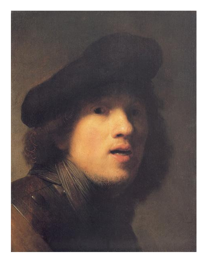
Figure 2. Self-portrait, (1629). Perplexity.

Taken individually, one by one, each of these three self- portraits expresses a specific emotional state of mind that relates to a precise qualitative level of development of Rembrandt's mind. What you see, in the changes between them, is the physical space-time rate of creative mentation of three discontinuous emotions reflecting three singularities of the process of creativity in the simultaneity of eternity of his lifetime. As such, consider all three states together representing a single unity of effect that does not reflect a particular change, but a rate of change that is observable only from a fourth higher level of consciousness. Each of the three self-portraits is an expression of a level of relativistic physical space-time, but a fourth level of consciousness bridges the discontinuities through the discovery of principle that dominates Rembrandt's active life during a period of 33 years of development. This is how the principle of poetic irony takes the form of simultaneity of eternity connecting different relativistic events in physical space-time. So, it is only with this fourth level in mind, that you can truly understand each case separately. So, what emotion does each self-portrait reflect, specifically?