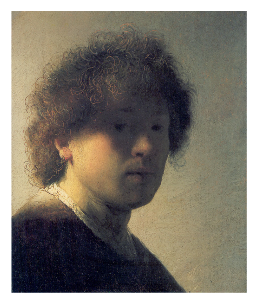
Figure 1. Rembrandt van Rijn, Self-portrait, (1628). Paradigm of a cultural isotope.

So, his self-portraits were consciously designed to express the dramatic qualities of what comes and goes, is born and dies in the human soul and between human souls. It is as if light and self-consciousness were always meant to be the two companions best suited to work together in the task of piercing through the window of his own perception. One look through the window of his eyes and you can see the intention of his soul. The question here is: "what does he see behind the shadow screen of his vista?"