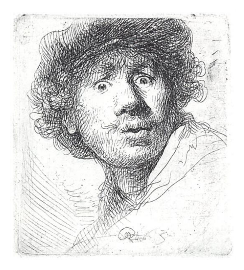
Figure 3. Self-portrait (1630). Discovery.

Perplexity is the most important emotion that unlocks the door to the discovery of some important truth. It is the key that unlocked the state of mind of the slave boy in Plato's Meno when he discovered he was at first incapable of finding the solution for doubling the square. Here, Rembrandt painted his own eyes in the shadows in a way reminiscent of the Self-portrait (1628) to attract the viewer inside of his thought, but those eyes are much more inquisitive. His mouth is very different and is shown half-opened expressing bewilderment. The general effect is the state of ambiguity, as if he were confronted by a contradiction in his perception, that is to say, by something that should not be there, but which is staring him in the face just the same. The next step is the discovery of the cause of this anomaly.