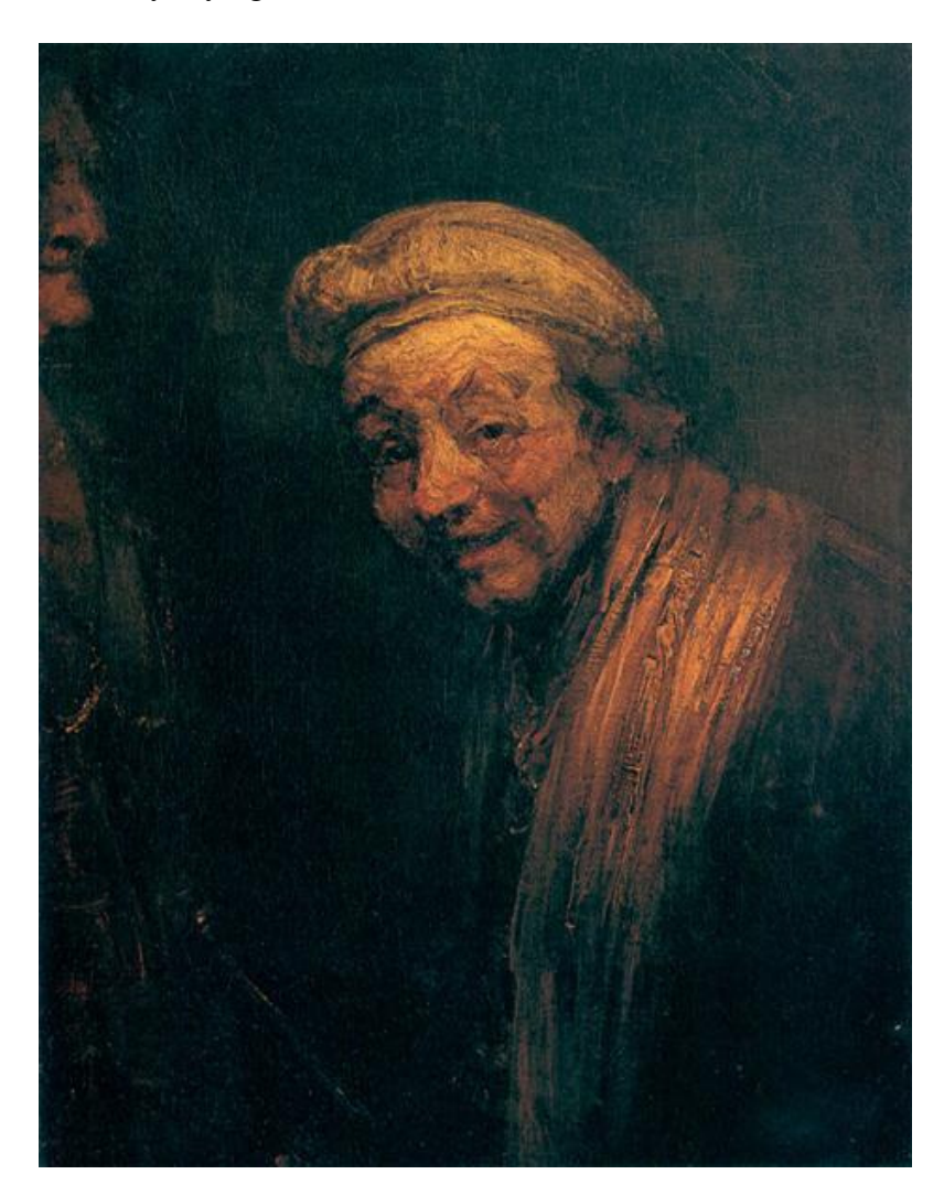
Figure 4. Self-portrait, (1662). Laughter.

which is a very joyous and stunning state of mind, characteristic of the actual discovery of a higher plateau of thinking that you did not know existed before and that you could access only by way of the truth. That state is the actual moment of the discovery of principle. Moreover, the excitement of that moment makes you discover that you can replicate it, again and again, by making others go through the same steps of the process. Here, Rembrandt's eyes are no longer in the shadows and express total surprise, staring at the spectator, as if to say to him: "Hey! Do you see what I see in your mind?" His mouth also expresses the sense of surprise with a touch of theatrical realization of the truth. Rembrandt seems to by saying to us: "So, this is what it was all about!"