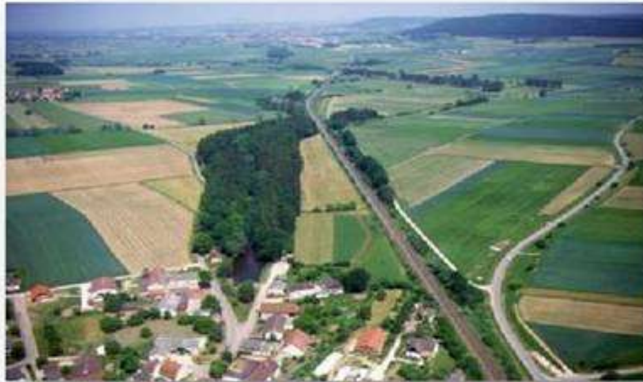
Figure 4. Fossa Carolina.

helping hand of Venice. That could have been the NAWAPA of the Carolingian period. But, it was never finalized. How did this inversion work? This can only become knowable after you have solved the paradox of chirality in your mind, first and foremost. So, ask yourself: how was Charlemagne able to solve the apparent paradox between the East and the West?