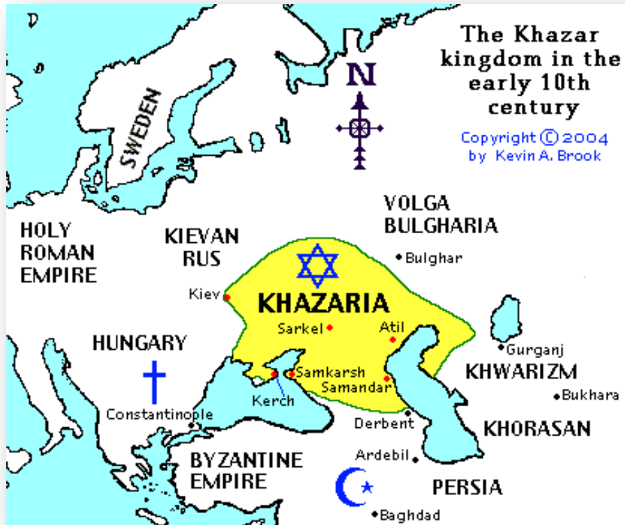
Figure 3. Map of the Jewish Khazar Kingdom.

Augustinian three-fold ecumenical project. But, on the other hand, since the Jewish King of Khazaria, Bulan, had an army that was entirely commanded by Muslim Officers and a majority of its 7,000 soldiers were Muslims, it became evident that only Harun al-Rashid could have implemented such a Khazar defense system from his headquarters in Baghdad. Furthermore, the Supreme Court judicial system of Khazaria was also an incredible ecumenical innovation since it was ruled by seven judges, two for the Muslims, two for the Christians, and two for the Jews, with an additional one for pagan Rus. Based in Atil (Itil), the capital city of Khazaria (Ukraine), the Supreme Court was overseen by the Jewish King of Khazaria. (Figure 3)