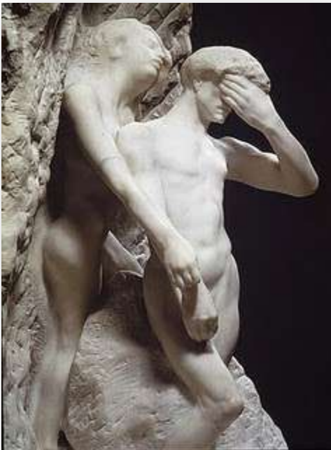
Figure 2. Auguste Rodin, Orpheus and Eurydice.

The marvel of this Greek myth is that the mortal Orpheus was allowed to bring his wife back from the dead through the enchanting truth of his creative talent in artistic composition, which was so powerful that all of the deities of the underworld were mesmerized and could not find any measure against him to punish him for his outrageous daring. However, there was a condition attached to Orpheus' daring courage before the gods of darkness. Proserpine, Queen of Hades and goddess of rebirth, imposed upon him the condition that during his return from Hades, he was not to look back . Orpheus accepted, but, just before reaching the dawn of day, he was tempted by a mad desire to see if Eurydice was still following him. He turned back to look and, breaking his commitment to look only forward into the future, his power over the gods was lost, and so was Eurydice, who died a second time.