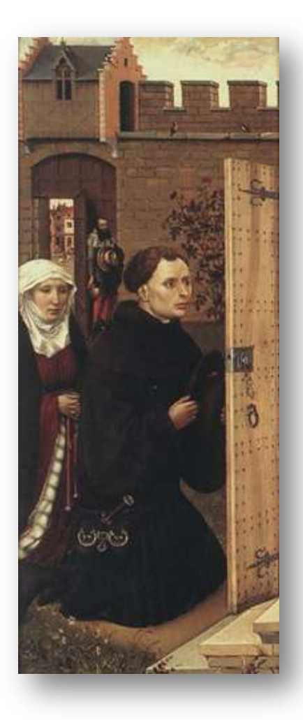
Figure 2. The Patrons in the left panel.

In the left panel, Campin introduces the sense perception level of forecasting. Furthermore, he emphasizes a conceptual difference between the foreground and the background. He is telling us something that is not visible to our physical eyes, but which is only visible to our mental eyes. These intervals of relations from side to side and from front to back actually represent the effective function and nature of the process of metaphor, the actual measure of change. And, whatever lies in this in-betweenness is not a thing, because the objects of the painting do not represent themselves. What prophetic news, therefore, are these intervals intimating?