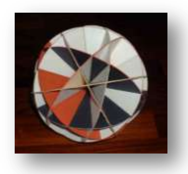
From the desk of Pierre Beaudry

والمواما والموام والموام والموام والموام والموام والموام والموام والموام والموام والموام والموام والموام والموام والموام والموام والموام والموام والموام والموام والموام والموام والموام والموام والموام والموام والموام والموام والموام والموام والموام والموام والموام والموام والموام والموام والموام والموام والموام والموام والموام والموام والموام والموام والموام والموام والموام والموام والموام والموام والموام والموام والموام والموام والموام والموام والموام والموام والموام والموام والموام والموام والموام والموام والموام والموام والموام والموام والموام والموام والموام والموام والموام والموام والموام والموام والموام والموام والموام والموام والموام والموام والموام والموام والموام والموام والموام والموام والموام والموام والموام والموام والموام والموام والموام والموام والموام والموام والموام والموام والموام والموام والموام والموام والموام والموام والموام والموام والموام والموام والموام والموام والموام والموام والموام والموام والموام والموام والموام والموا