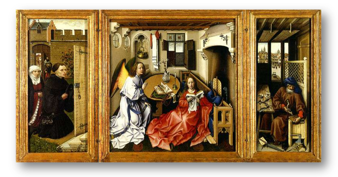
Figure 1 . Robert Campin (Master of Flemalle), the Mérode Altarpiece , 1425-30. (Cloisters, Metropolitan Museum of Art, New York City.)

cognition , is different from the first two, because its object is divine. Creative cognition is the level of the metaphor as such, the higher intelligence function which comes only from the creative mind.