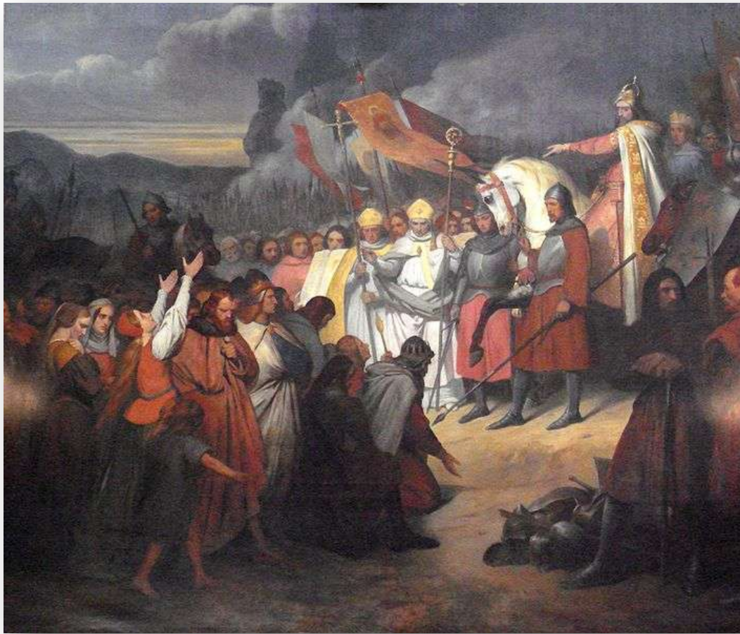
Figure 2. Charlemagne (742-814) receiving the submission of Widukind at Paderborn in 785. By Ary Scheffer (1795-1858)

Charlemagne's decision to summarily execute 4,500 Saxons was a very grave decision indeed, under any circumstance; however, very few historians have understood why Charlemagne made such a horrific decision. The point, here, is not to debate whether the action was right or wrong, but to look at the situation clinically and to understand the reason why Charlemagne had to make that decision. The issue touches on the degree of degeneration of an entire people after suffering from a long period of collapse in civilized values. The attention has to be focused on that intention. It was not the treasonous act itself that was the problem, but the underlying erosion of the social fabric by the degenerate cowardness of a lying population. Similarly, as The Angelides Report stated: "First, to pin this crisis on mortal flaws like greed and hubris would be simplistic. It was the failure to account for human weakness that is relevant to this crisis."