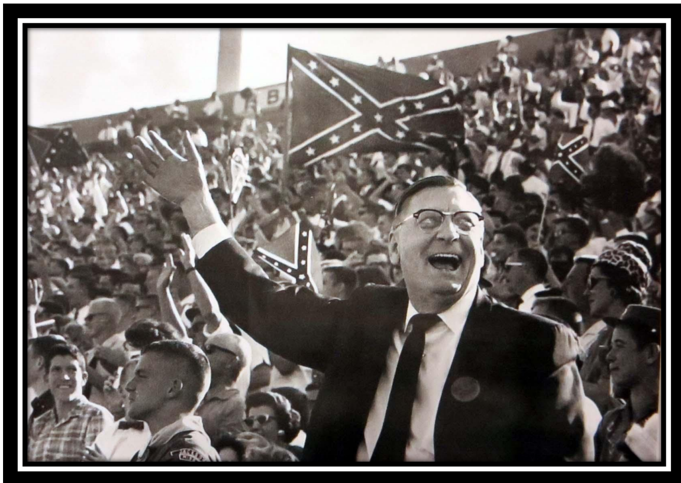
Figure 2 Governor Barnett whipping up the fans of the Confederacy.

For unreconstructed Confederates, Governor Barnett’s role was the “high-water mark” of the Russia-gating of King. It was the culmination of six years of frenzied fulminations. However, in reality, it was as pathetic as the Confederates’ “Pickett’s Charge” at Gettysburg in 1863, a century prior.