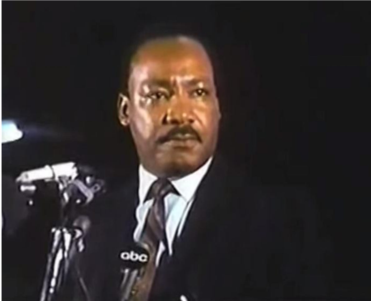
Figure 3 Martin Luther King, (1929-1968)