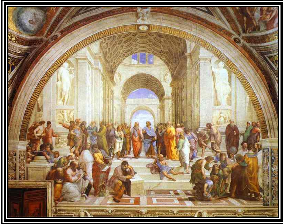
Figure 1. [ The School of Athens . 1509. Fresco. Vaticano, Stanza della Segnatura, Rome.]