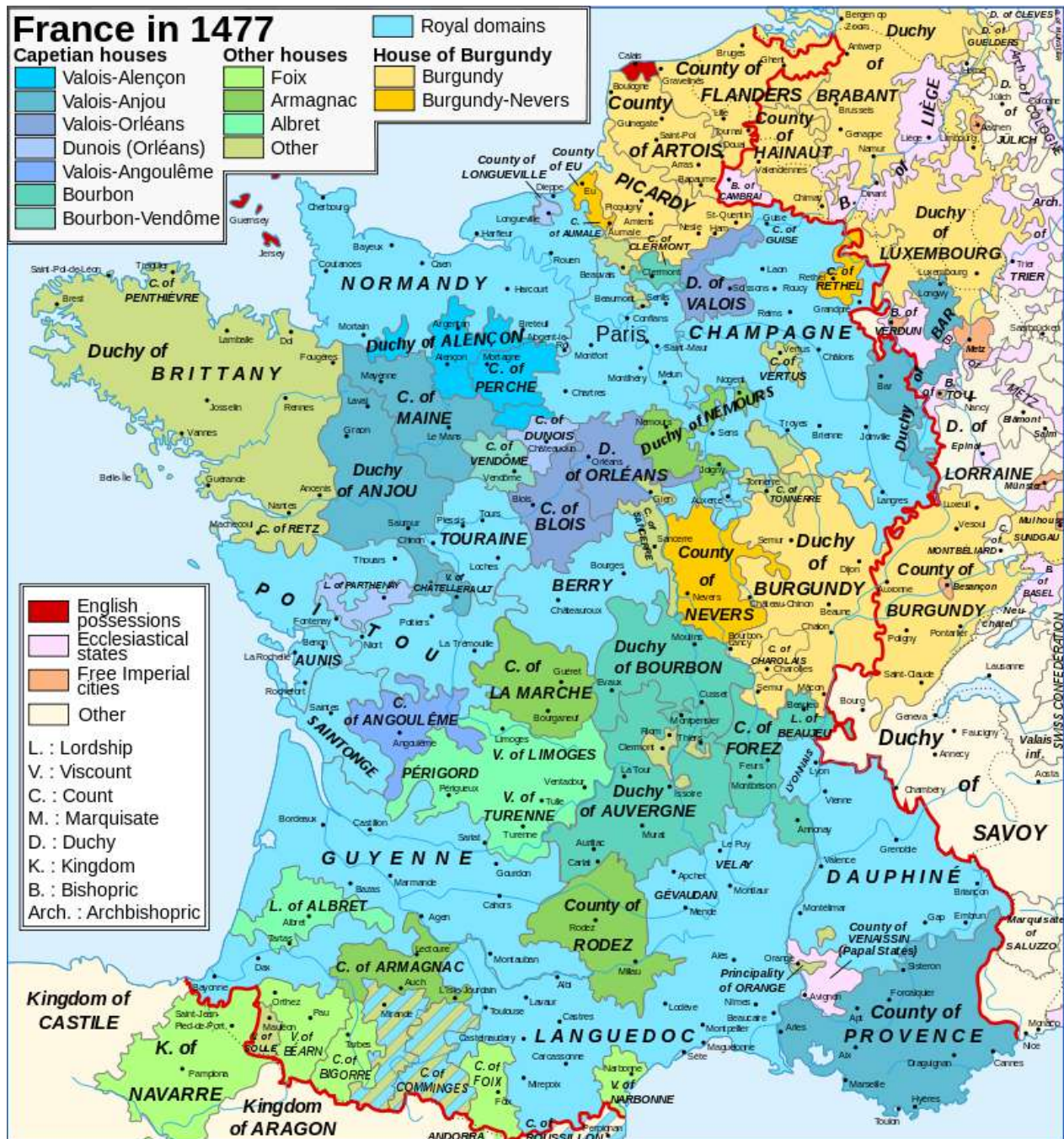
Figure 3 The Burgundian territories (orange and yellow) after the 1477 victory of Louis XI against the Duke of Burgundy, Charles the Bold. All of the Duchies and Counties of France joined Louis XI to create France, the first nation state of Europe, at the exception of the Burgundy part of Lotharingia which became Hapsburg imperial territory.