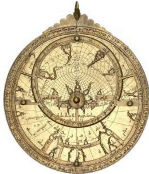
Figure 3 A stylized Masudi Map of the World made to resemble the Rete of an Astrolabe ironically centered on the region of Mecca instead of the Pole Star.

On the dimly lit wall of Plato's Cave, the king appears to be constantly attempting to satisfy his curiosity that the Quraysh is who he says he is, and the Quraysh keeps responding to the questions of the king apparently to make sure he