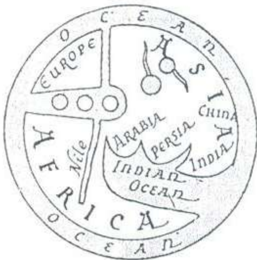
Arabic Cartograms, used in Medieval Arabic School Maps

The point that Masudi is making is that although ministers and diplomats generally lie to friends and enemies alike, in order to keep the truth for their King's ear only, the case of the Quraysh, who is a descendent of Ishmael and of the Banu Hashim clan that gave birth to the prophet Muhammad, is a reflection of the Islamic insight into the Platonic tradition of respect for the truth. It is crucial, here that the reader makes the connection between insight and truthfulness, because only an insightful person can be morally committed to the truth, no other.