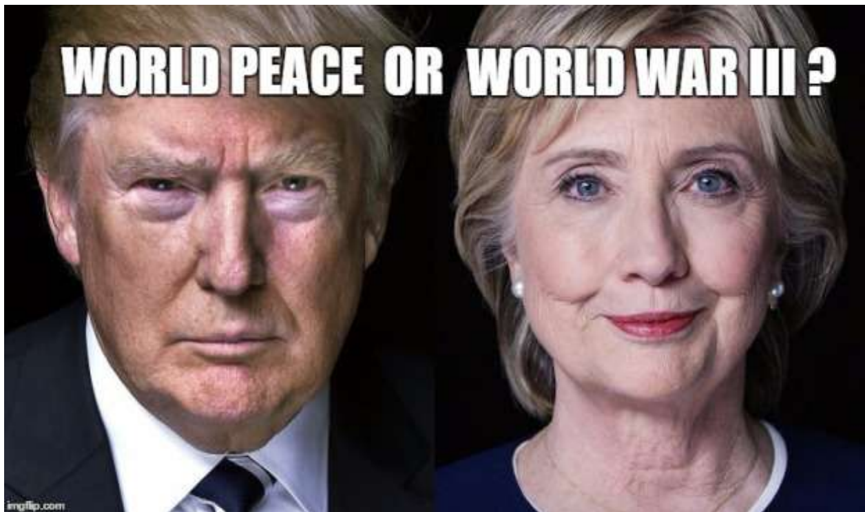
Figure 1 The two faces of madness in the current American Presidential Election.

This report will deal with essentially two questions. First, how can you tell when you are being manipulated by a satanic operation? Secondly, how do you establish a lasting Peace of Westphalia? Let's start with the more difficult question first: How can you tell that this poster is a SATANIC OPERATION? ( Figure 1 )