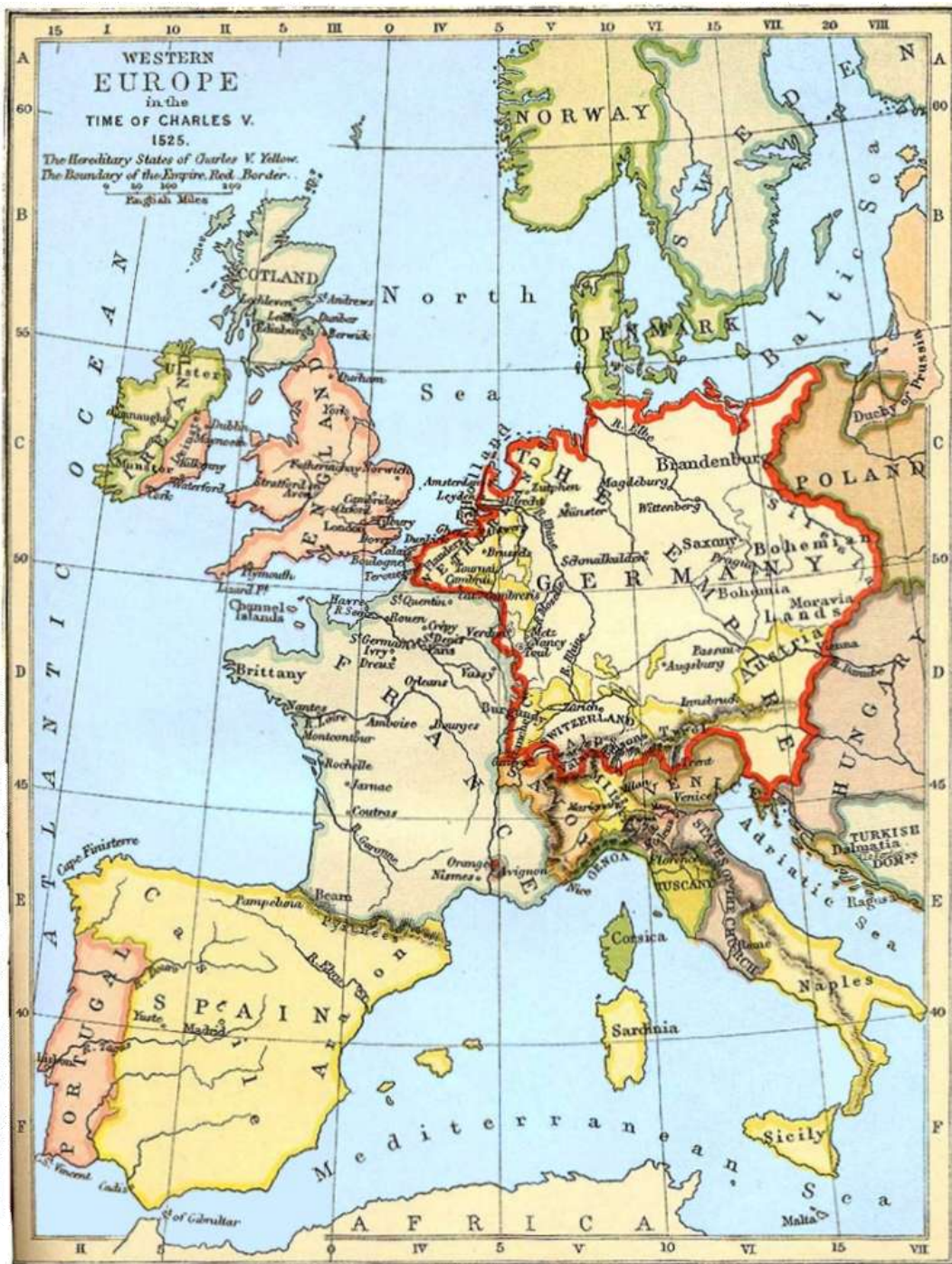
Figure 2 Western Europe after Charles V won the Battle of Pavia in 1525. The entirety of the Lotharingia region had been recaptured by Charles V at the exception of Savoy.