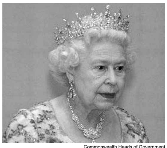
Commonwealth Heads of Government

ent academic and contingent sets of educational practices, have lately tended to discard the high standard for science which had been that such as what Max Planck and Albert Einstein had represented in their time. Whereas, their opponents from the ranks of the late Twentieth and Twenty-first centuries, have tended toward the brutishly crude, ideological practices, practices which have polluted what had been formerly the honorable, scientific classrooms, now supplanted by the thuggery of Bertrand Russell's legacy.