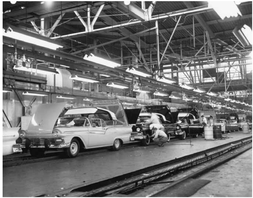
Ford Motor Co.