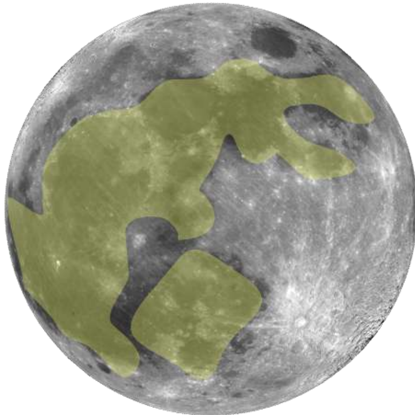
The Jade Rabbit (玉兔) on the Moon.