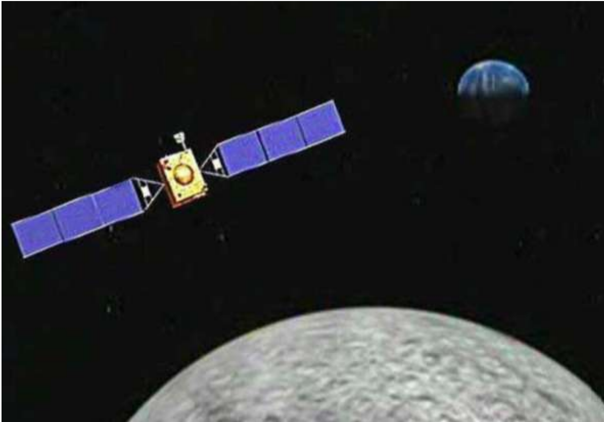
The Queqiao relay satellite.

Previous Chang'e missions set the stage for Chang'e-4: