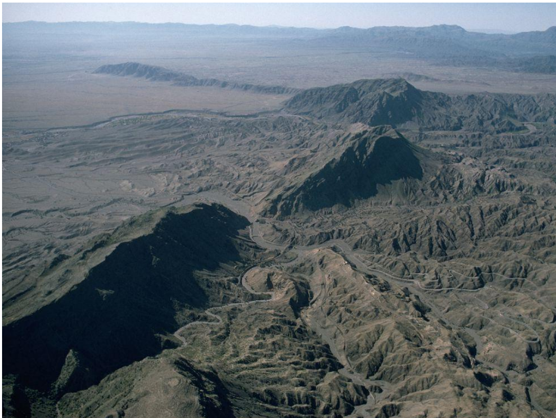
Khyber Pass.

The fate of mankind today hangs in the balance with the future of Afghanistan. While the American troops have been pulled out of Central Asia and the Taliban are everywhere gaining ground and threatening to bring about civil war with the overthrow of the Ghani government, there are everywhere intense talks taking place across the nation of Afghanistan for the purpose of creating the only miracle of economic development capable of gradually effacing the horrors of “endless wars” that the Anglo-Americans have created during the past 20 years. The question