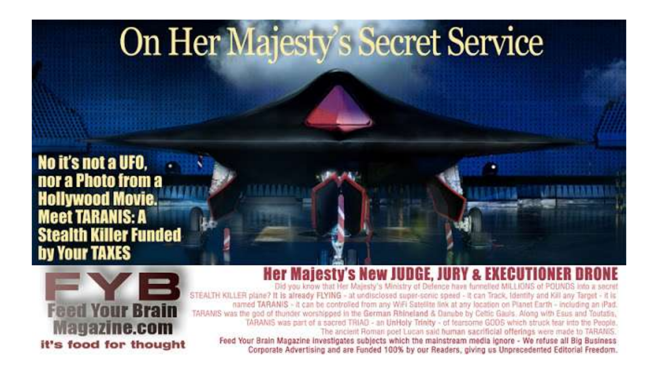
Figure 1 The British Ministry of Defense (MoD) prototype Taranis, Unmanned Combat Air Vehicle (UCAV) produced by BAE. Welcome to the new justice executioner of the British oligarchy. (British Brain operative, <u>Film Director & Author CHRIS EVERARD</u>)

vampire sucking the blood of economic life. As Lyn showed, Alexander Hamilton corrected that fake identity by restoring money to its rightful function of credit: "Trading money for money, the customary British practice, for example, is merely usury, not creativity. It is only in the process of production that the role of money can achieve its proper purpose for society. Hamilton's notion of the function of credit achieves that required function of money in the economic process. It is productivity as such, which is the only realization of a value for money." (Lyndon LaRouche, Note on Hamilton for THE FUTURE AS A SUBJECT , 2/14/2014)