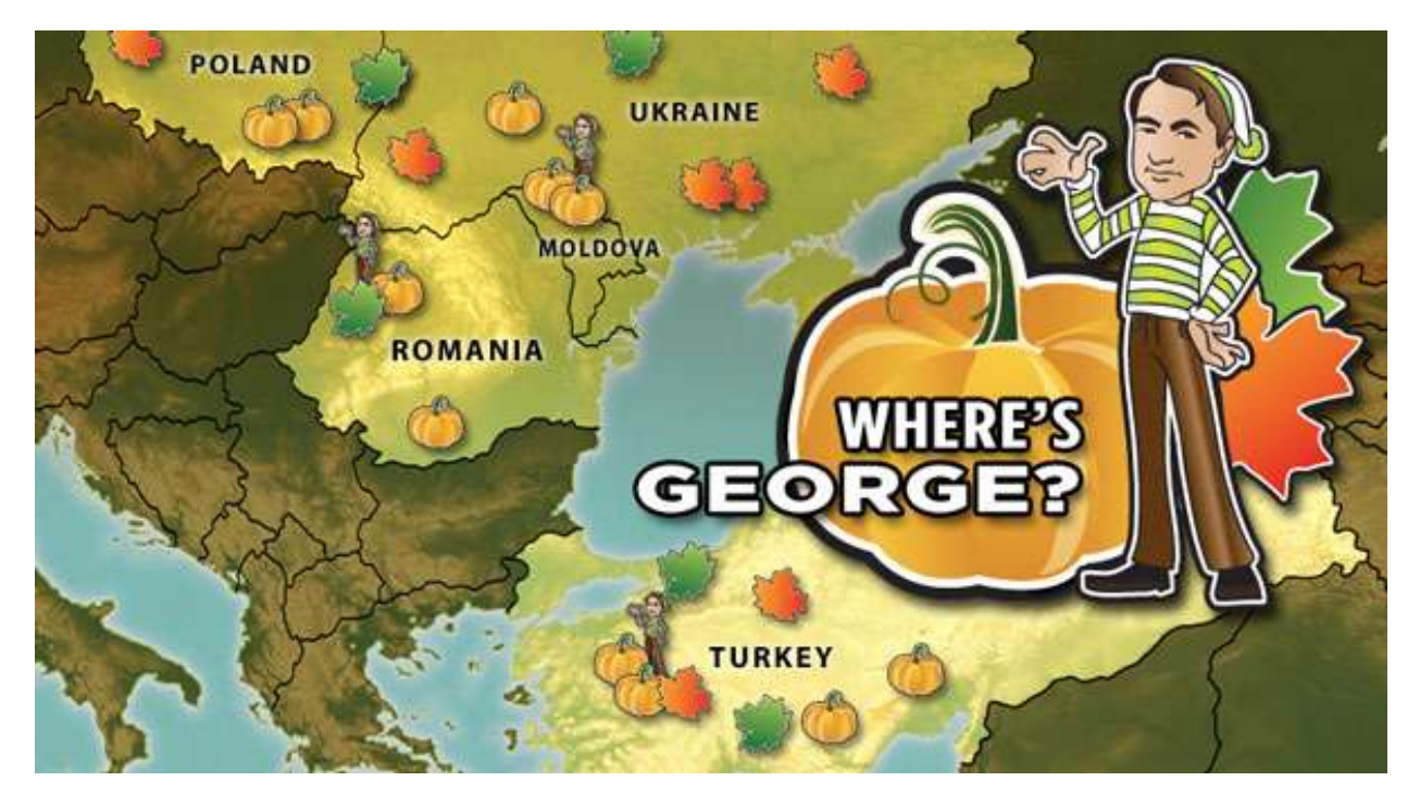
Figure 3 George Friedman touring the BORDERLANDS of Eurasia.

It is clear that a war tragedy is now taking place in Ukraine because, like Moldova, Ukraine happens to be located where world powers collide and such powers will tend to abuse the local populations for purposes foreign to them. The peoples living in those borderland regions should be given the chance to choose their own destiny and an explicit right to be protected from foreign imperial designs. It seems that Russia and Ukraine are the only sovereign nations in a position to respond positively to such a need. Thus, it becomes clear that anyone pushing NATO in that region of the world is a fool looking for thermonuclear World War III.