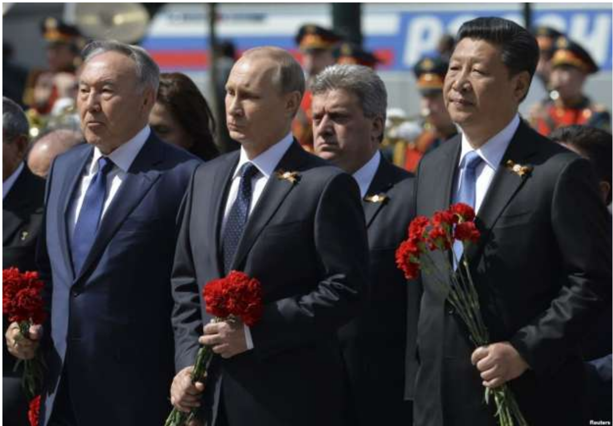
Figure 2 Russian President Vladimir Putin, Kazakhstan's President Nursultan Nazarbayev, and China's President Xi Jinping take part in a wreath laying ceremony at the Tomb of the Unknown Soldier on the Victory Day by the Kremlin walls in central Moscow.

During the 6 th century, in India, the ancient board game of backgammond became eclipsed by the game of chess, because it appeared to bring more intelligence to the board game. In backgammon, everything depends on the roll of the dice. This is the reason why during the Gupta Empire it was deemed that the intelligence of the chess piece moves was superior to backgammon, because the individual pieces were given the appearance of different powers as one army moved against the other on the chess board. But that was an illusion, because the chess board master had conceived the game as “kill or be killed.”