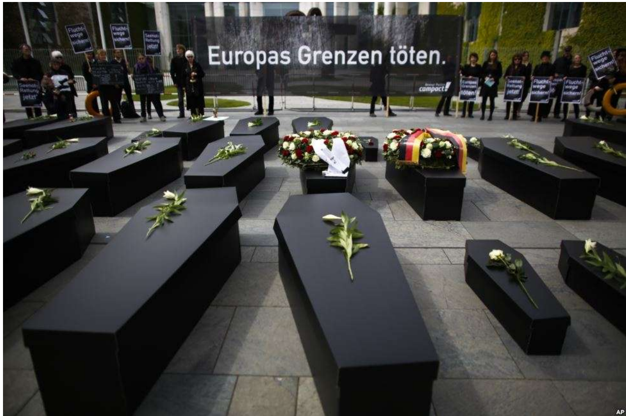
Figure 4 Paperboard caskets are on display in front of the chancellery during protest of the civil society group 'Campact' against European refugee policy in Berlin, Germany. The main banner reads: 'European borders kill.'

Thus, the British idea of nation-state is dead. And, such is the mission of mankind where the theological intention has now become the teleological purpose of mankind. As Lyn put it: